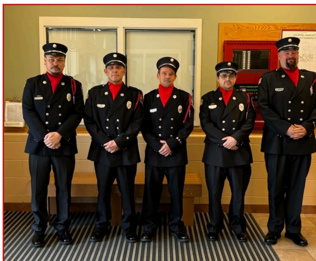
Durham Fire & Rescue's Color Guard once again had the honor of posting the colors at the annual town meeting.